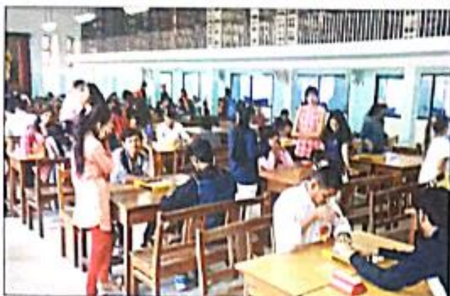
Visually challenged Students Inter Collegiate Chess Tournament