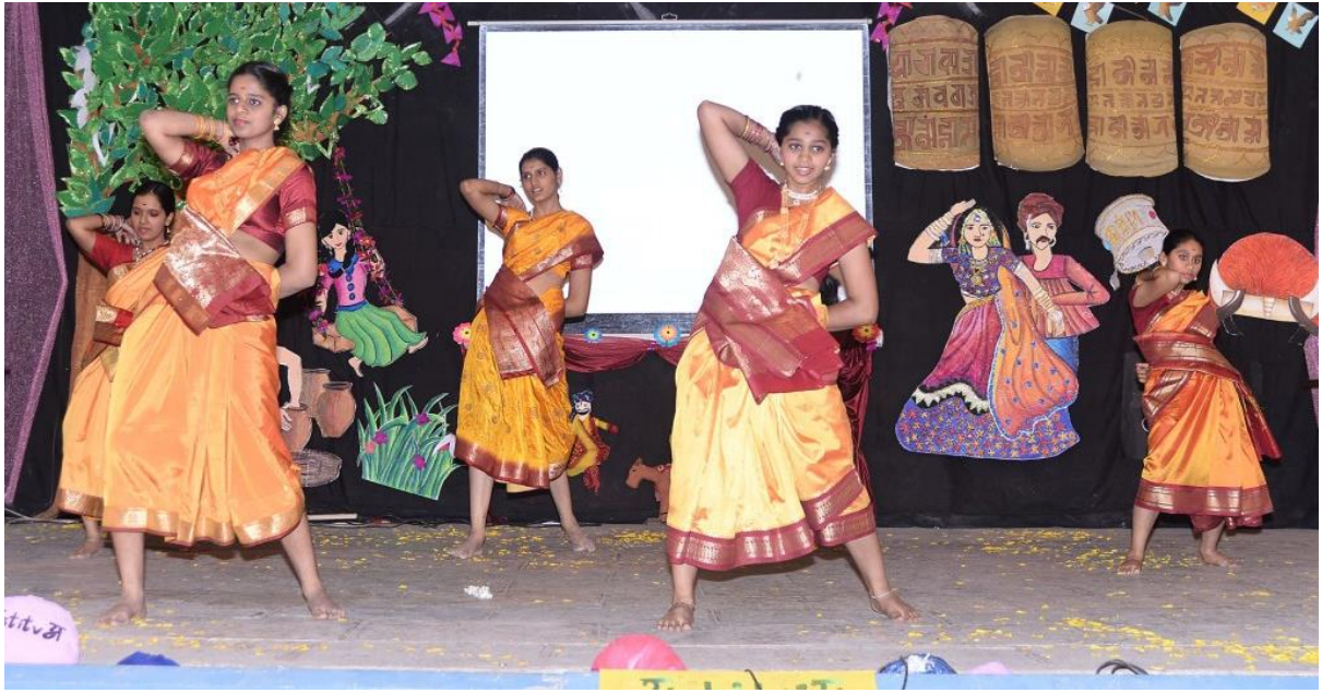
Shiv Jayanti Celebration