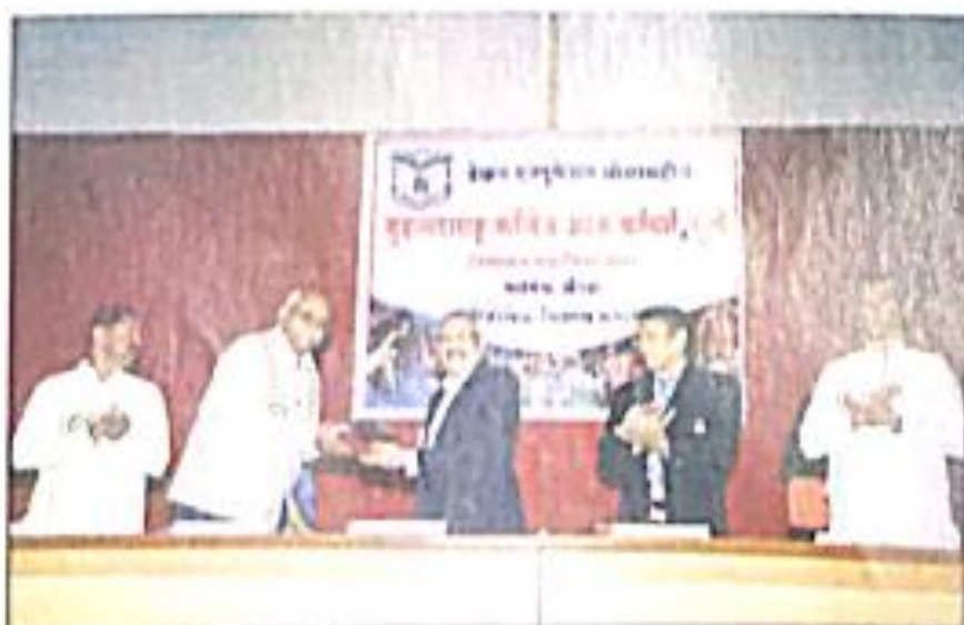
Gymkhana Day Function