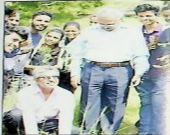
Tree plantation at Hanuman Tekadi on the occasion of Platinum Jubilee of the college by Nature Club