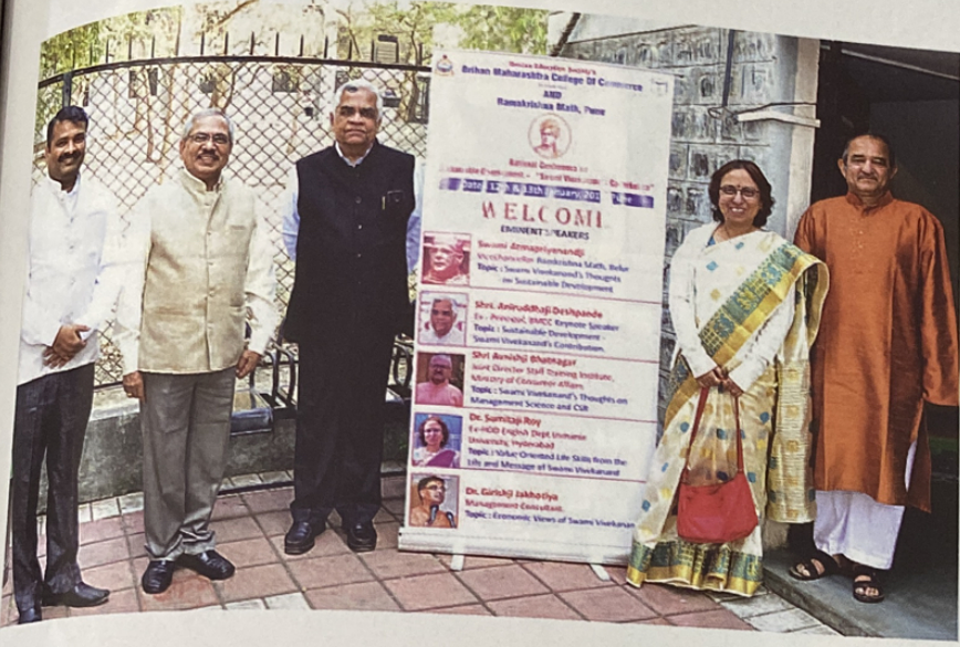
◀ Dignitaries at the National Conference on 12th Jan. 2019